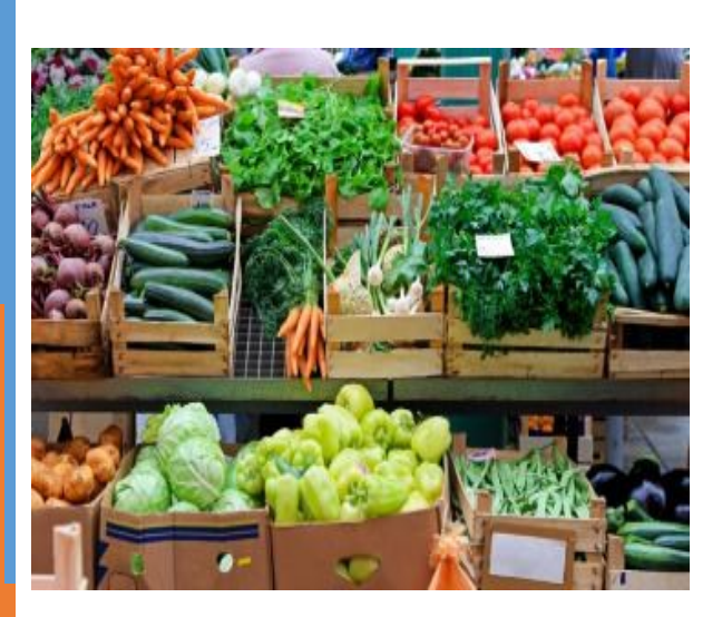
The Downtown Saginaw Farmers' Market continues the wonderful tradition of farmers markets in Saginaw for the last century by providing fresh local produce and offering a welcoming gathering place for the entire community and region.