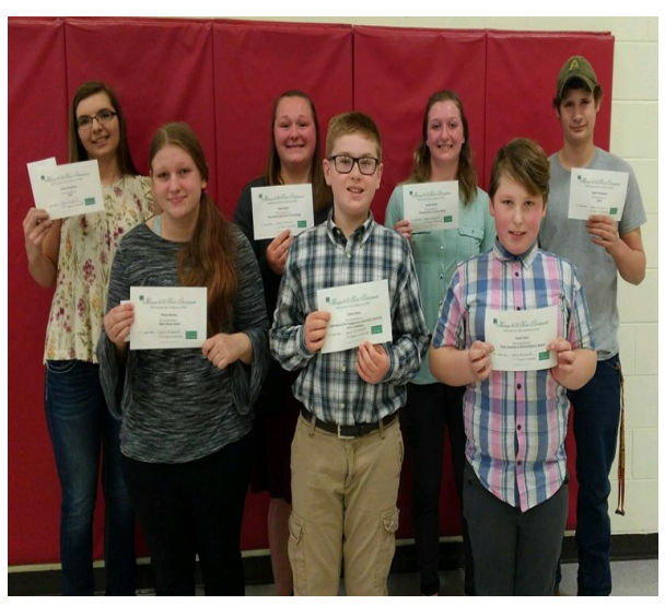
4-H Youth receive award pins and certificates