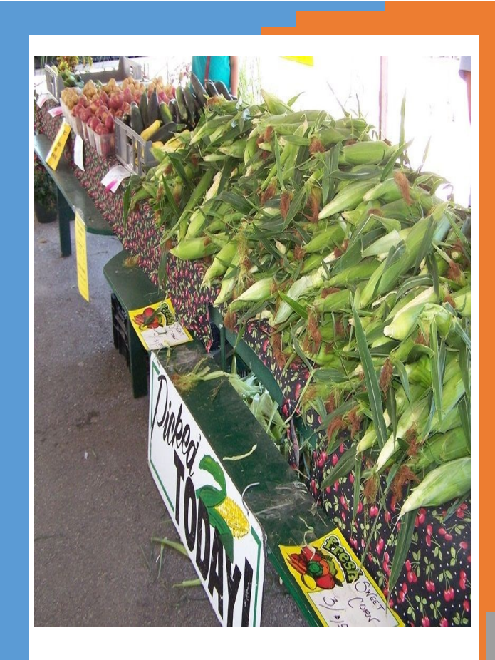
Find out more about the Downtown Saginaw Farmers Market at http://www.saginawfarmersmarket.org/

In Saginaw County, there are farmers markets operating in Birch Run, Chesaning, Frankenmuth, Hemlock, St. Charles, and Saginaw. Vendors at these markets come from the region with most traveling fewer than 30 miles to sell at the market. The regional food system in the Great Lakes Bay Region is strong.